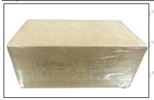
Pic No. 2 Domestic express packaging: Wrapped with Transparent tape